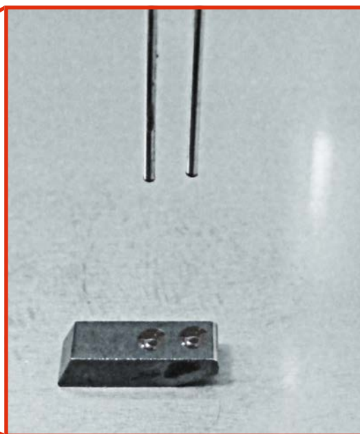
Tungsten carbide saw tooth: Flux paste F 300 DS 12 applied to a tungsten carbide surface