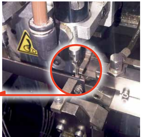
Brazing machine for circular saw blades – flux application area

voestalpine Böhler Welding Fontargen GmbH