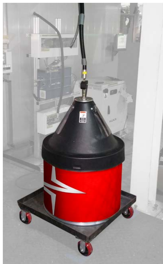
200 kg drum with wire feeding system