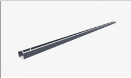
Rail profile with click connection