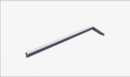
Triangle profile south