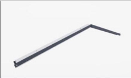
Triangle profile E-W