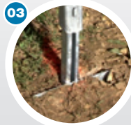
03 Interlocking posts in the baseplates