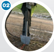
02 Inserting anchor baseplates with simple pneumatic hammer