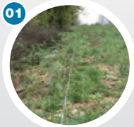
01 Marking out the fixation line with cord