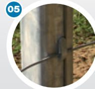
05 Closing the wire supports

« Our teams will help you to carry out your projects »