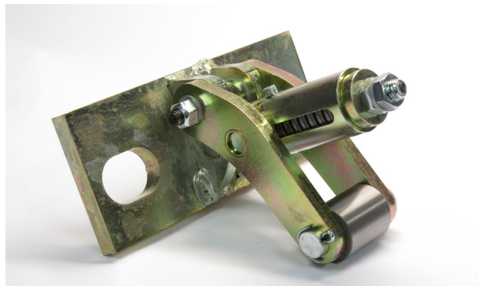
HiRoll Switch Point Roller Nov 2021