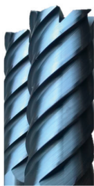
With EXXTRAL®-ultrafine coated solid carbide finishing cutter (Ø 10 mm).