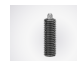
Spring ball plungers, flange lifters, spring bolts