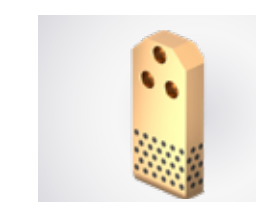
Guide bars, rectangular guide blocks, lockings