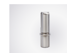
Guide posts, trunnions