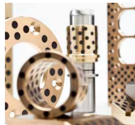
BRONZE WITH SOLID LUBRICANT

Contact and enquiry at www.voestalpine.com/camtec or at sales.camtec@voestalpine.com .