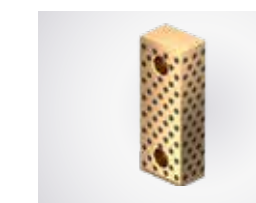
Multiple area guiding stripes