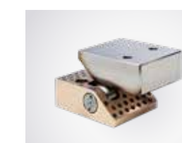
Cam stroke plates with/without rollers