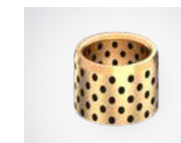
Bushings without flange

voestalpine Camtec has an extensive product range for use in the highly specialised industry.