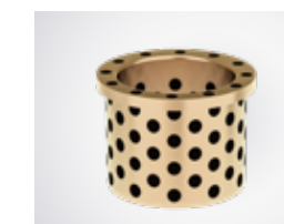
Bushings with buffer flange