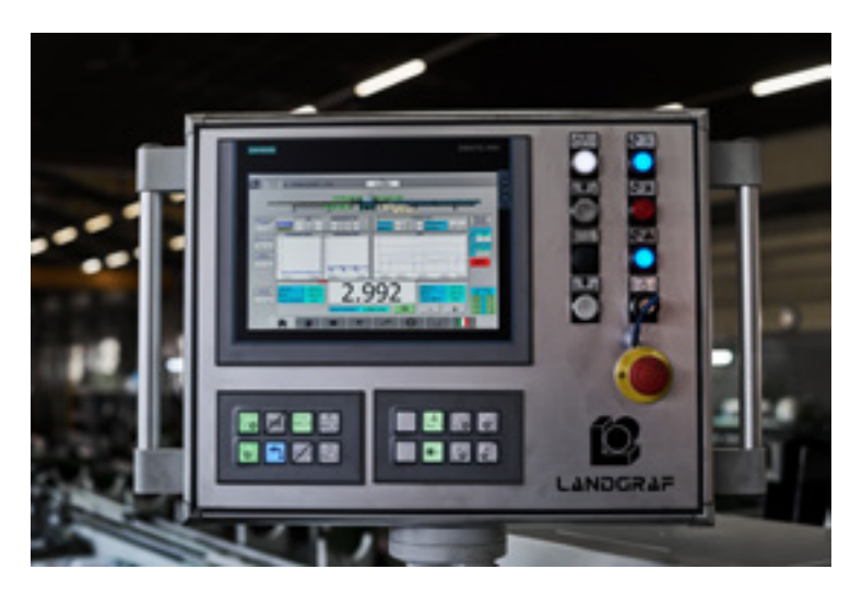
Our modern machinery guarantees high process process stability with the tightest tolerances.

We cover the entire production process from melting to just-in-time delivery.