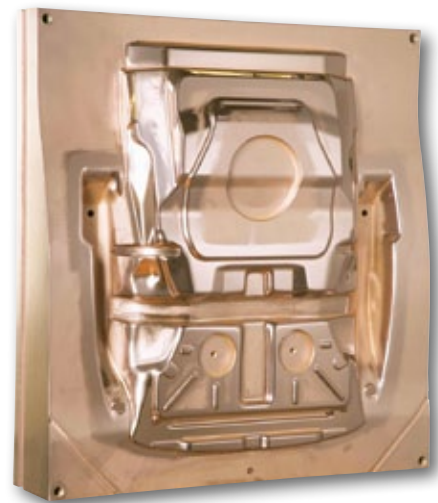
D2 forming die, coated with Duplex-VARIANTIC work material: hot rolled 1.0335 steel.