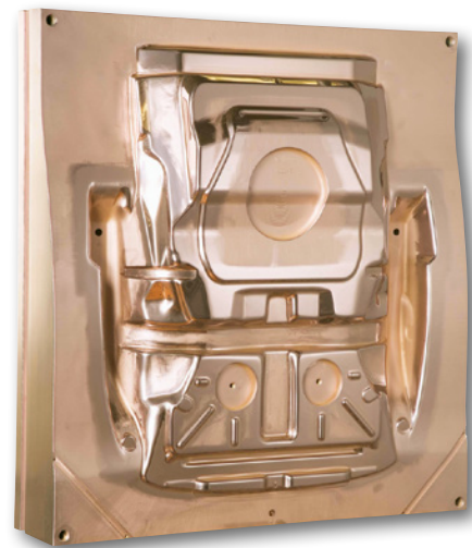
D2 forming die, coated with Duplex-VARIANTIC work material: hot rolled 1.0335 steel.