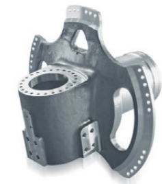
Spindle, 1500 kg