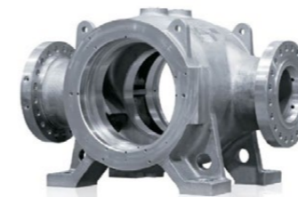
Pipeline compressor housing, 6000 kg