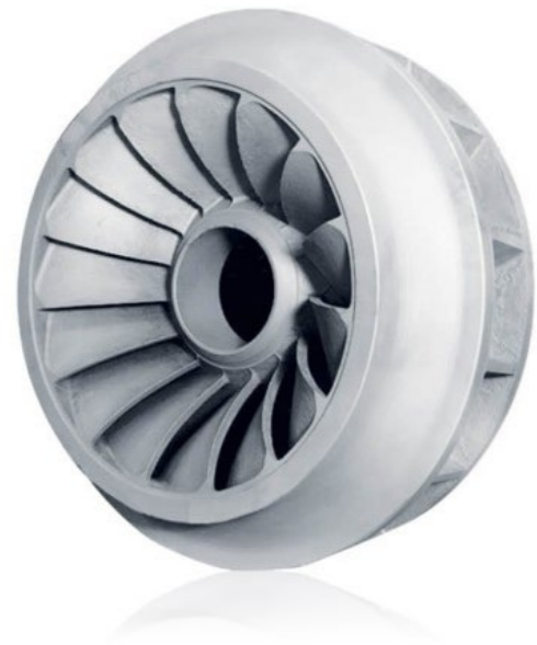
Francis impeller 3.000 kg