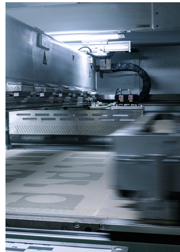
3D sand printing process