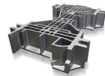
Lower die, 6150 kg