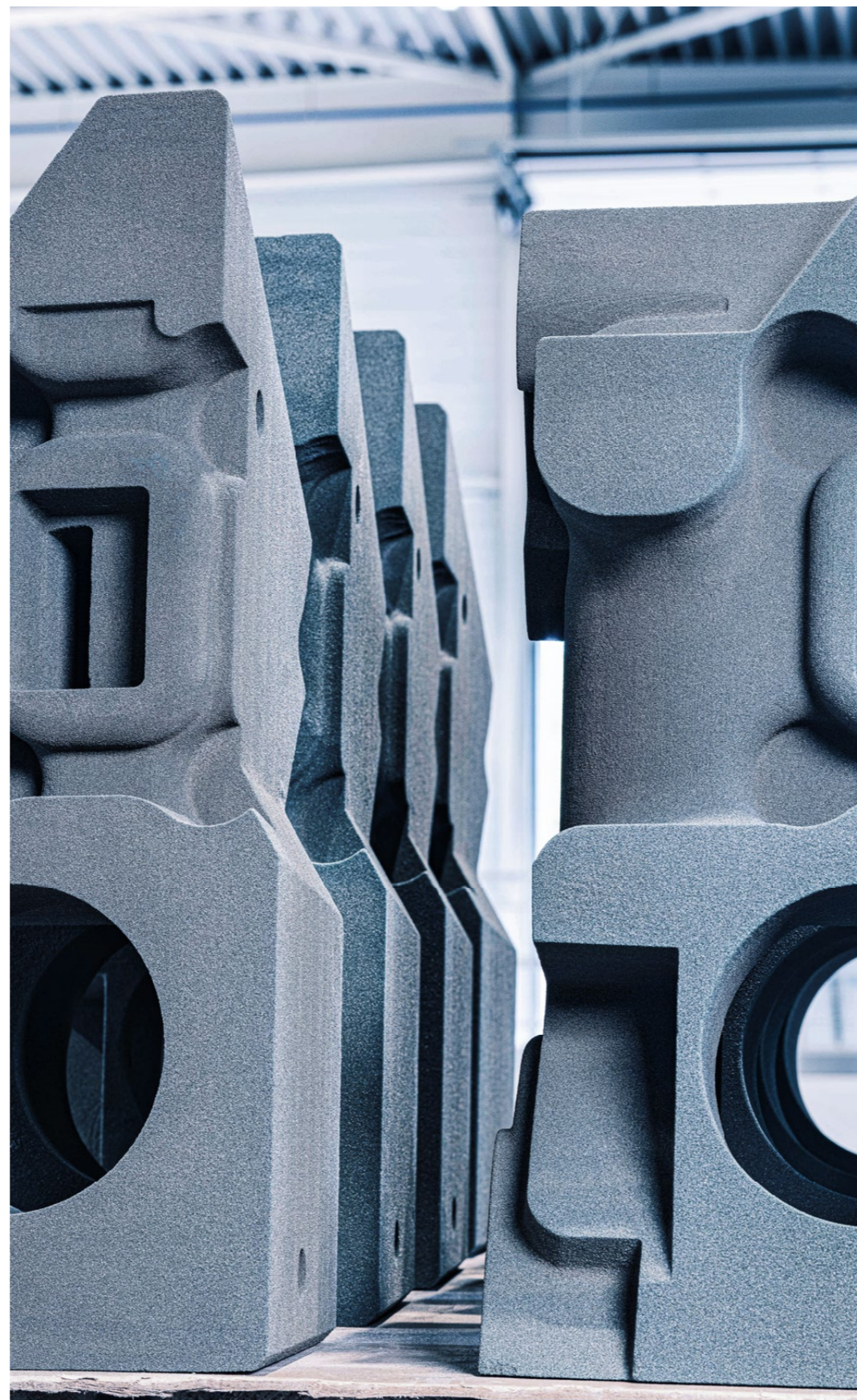
High-precision 3D-printed sand cores for use in the railway industry

At temperatures ranging between over 700 to minus 196 degrees Celsius, voestalpine Foundry Group develops high-temperature and low-temperature materials, casting designs and industry-leading processes to meet specific customer requirements. We test the materials using modeling, simulation and experimentation processes to ensure that the highest standards are met. We closely monitor the interaction of materials and supply our customers with products that meet their specifications precisely.